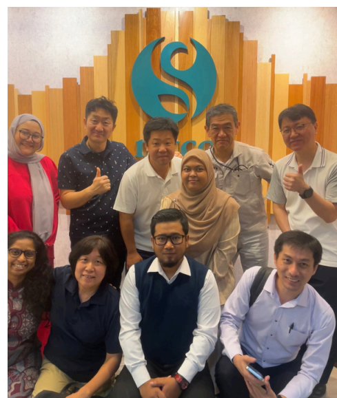
MTCC and Sojitz Malaysia representatives following a courtesy visit focused on strengthening collaboration in sustainable forestry and responsible wood sourcing.

The meeting served as a valuable platform to strengthen mutual understanding and explore further collaboration between both organizations in advancing forest certification and responsible timber sourcing under MTCS.