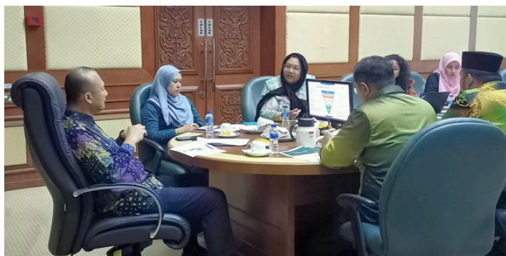
MTCC engages with UPEN Kelantan officials to discuss forest recertification efforts and the benefits of MTCS for sustainable forest management in the state.