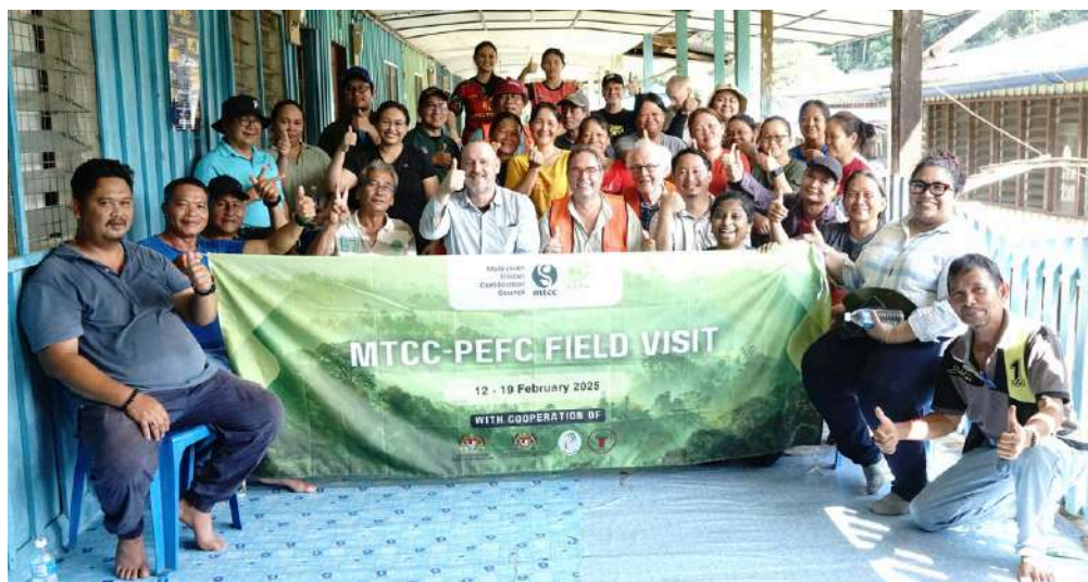
PEFC International Field Trip 2025 delegates pictured with members of the Paong FPMU community during their visit

MTCC hosted representatives from the Programme for the Endorsement of Forest Certification (PEFC) for an in-depth field visit from 12 to 19 February 2025. Two representatives of the Netherlands' Timber Procurement Assessment Committee (TPAC) also participated as 'observers.'