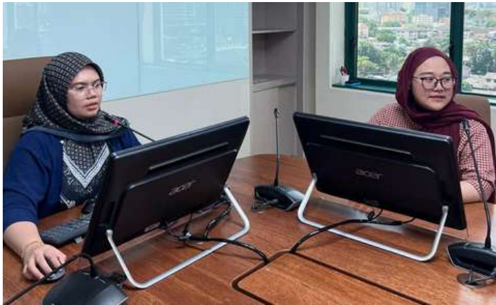
The MTCC team conducting an onboarding session for newly certified MTCS/PEFC Chain of Custody certificate holders, guiding them on certification standards and trademark usage