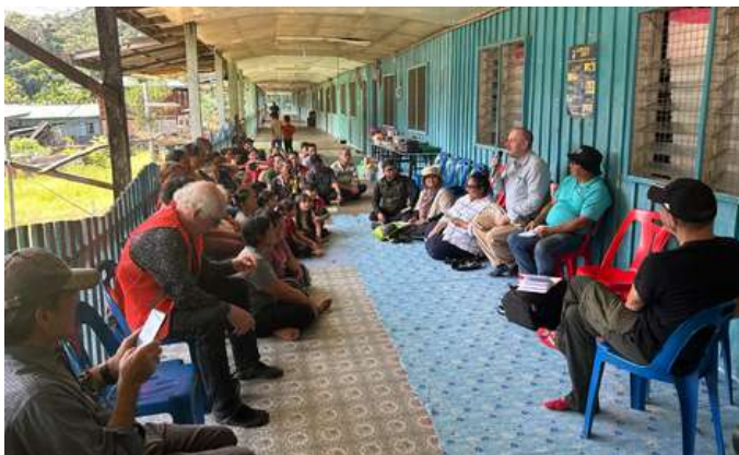
An independent consultant moderates a discussion between community members and delegates during a session on complaints mechanism and the role of a Community Liaison Officer in Long Tebanyi