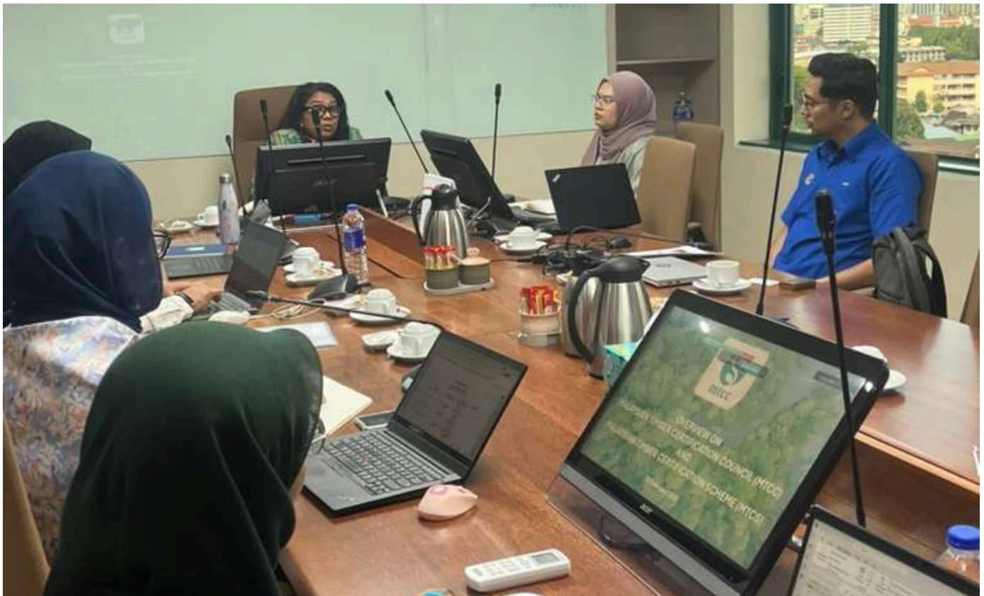
MTCC and SWCorp exchanging insights on strengthening waste management and recycling initiatives for a more sustainable future

During the session, SWCorp officers provided an overview of the organisation's core functions in managing solid waste and public cleansing in Malaysia. They also shared details on SWCorp's ongoing recycling programmes involving paper and wood waste, and outlined strategic initiatives under the Malaysia Solid Waste Circular Economy Blueprint 2025–2035.