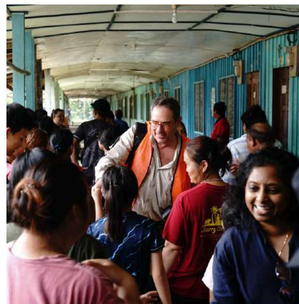
Delegates interacting with the Long Tebanyi community

For a detailed account of the field visit and its key engagements, outcomes, and next steps, read the official press release, "Strengthening Transparency and Collaboration in Sustainable Forest Management: Insights from the MTCC-PEFC Field Visit 2025," available on MTCC's website.