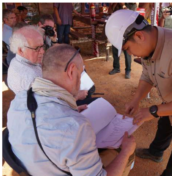
Delegates receive a briefing on forest operations in Perak, followed by a visit to Piah Forest Reserve to observe sustainable harvesting

The findings by PEFC International and TPAC, once published, will contribute to further strengthening the implementation of the MTCS.