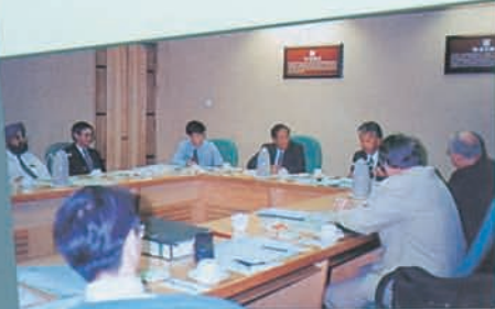
Malaysia-The Netherlands Ad-Hoc Working Group Meeting, Kuala Lumpur (22 - 25 June)