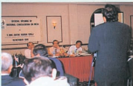
National-level consultation, Kuala Lumpur (18 - 21 October)

The SOPs adopted after the regional consultations were subsequently integrated into a draft set of the Malaysian Criteria, Indicators, Activities and Standards of Performance (MC&I) for Forest Management Certification (MC&I for Forest Management Certification in short) following discussions held on 13 - 18 September 1999 between NTCC Malaysia and the three Forestry Departments.