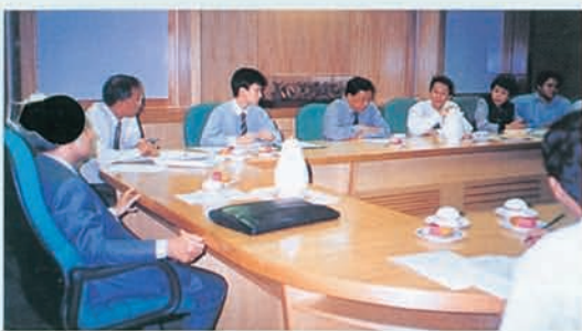
Briefing and dialogue sessions on the implementation of the timber certification scheme