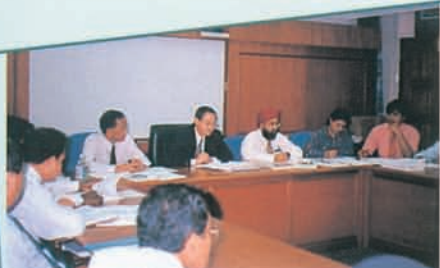
Regional-level consultation in Peninsular Malaysia, Kepong (9 - 13 August)